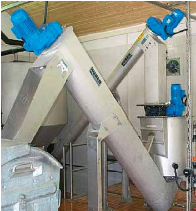
The HUBER Grit Washer RoSF4 T washes the classified grit from a HUBER Circular Grit Trap HRSF.