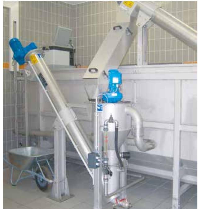
A small HUBER Grit Washer RoSF4 TC washing the classified grit from a HUBER Complete Plant ROTAMAT® Ro5.