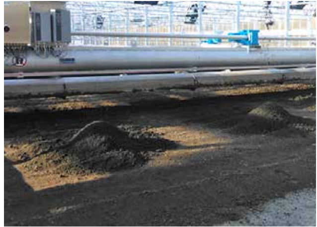
Automated sludge feeding with screw conveyors.