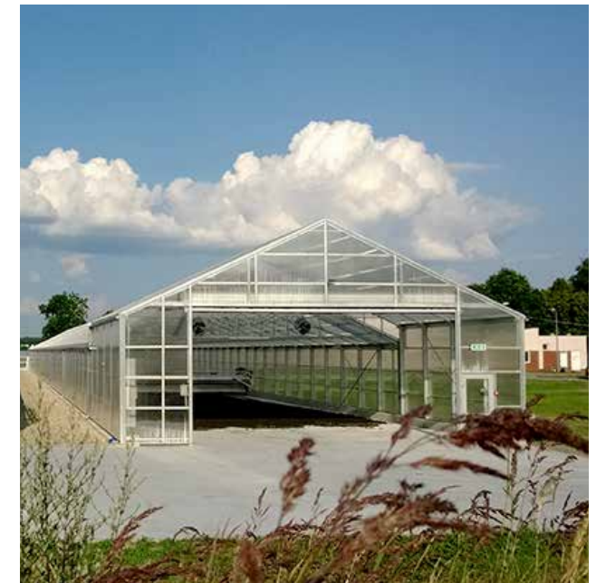
Dewatered sludge is transported in through gates.