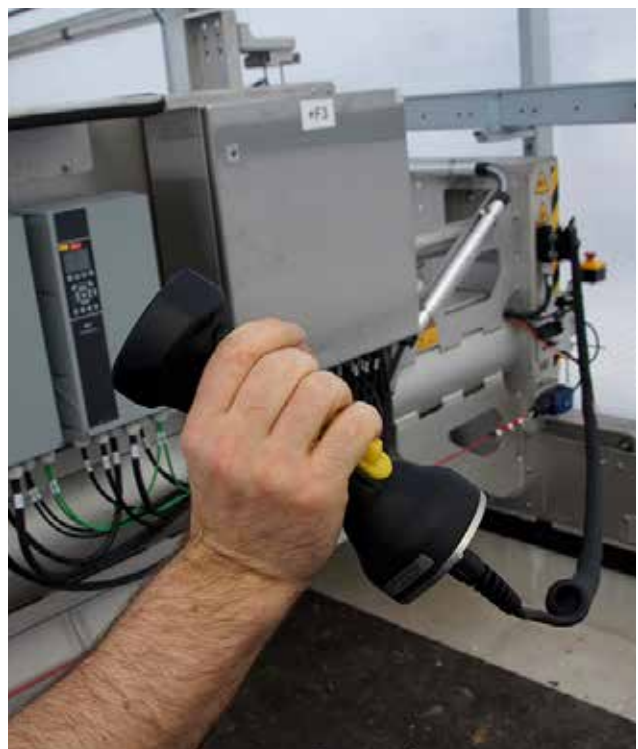
Enabling button for safe maintenance.