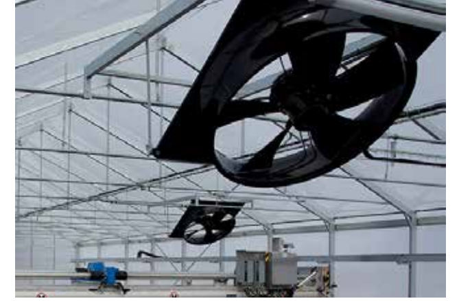
Recirculation air ventilators ensure improved evaporation.