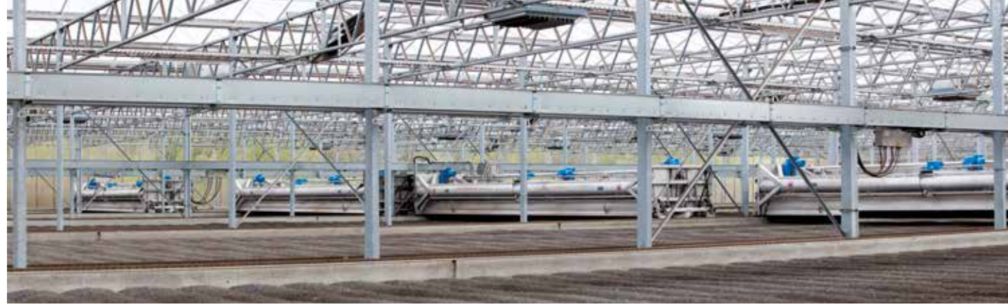
Parallel operation of HUBER Sludge Turner SOLSTICE® units.