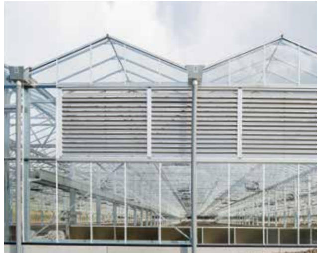
Fresh air enters the drying hall via weather louvres.

Our 20 years of experience and more than 250 dryer lines sold on all continents are proof of the high quality of the HUBER system and its suitability for application worldwide.