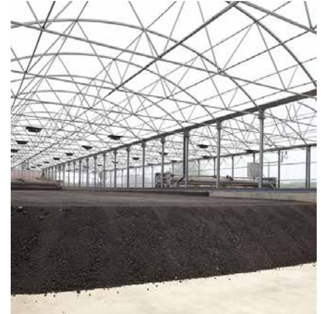
Dry sludge for removal by wheel loader and truck.