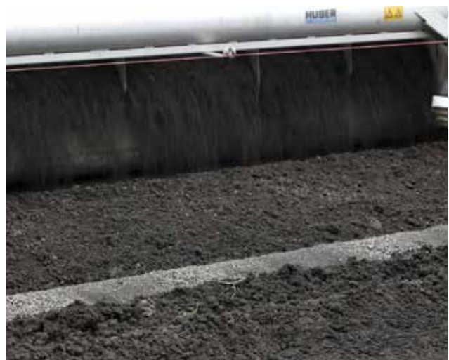
The HUBER Sludge Turner SOLSTICE® ensures an optimal drying bed – the sludge is spread, granulated, aerated, turned and backmixed.