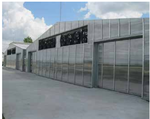
Exhaust fans remove saturated air from the drying halls.