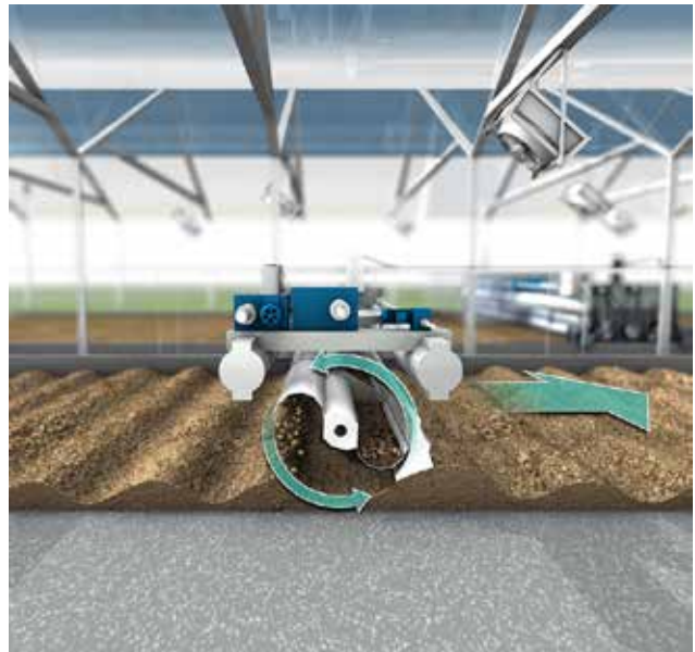
A double shovel is ploughing through the sludge bed and turning the sludge as the machine is moving through the greenhouse.

Optionally, the machine can be equipped with a blade that adjusts to the level of the sludge bed during sludge turning. A motor raises or lowers the blade depending on the measured sludge bed level. Larger sludge lumps are cut into small pieces between the rotating shovel and the blade, and the height and dry residue of the sludge bed can also be precisely controlled.