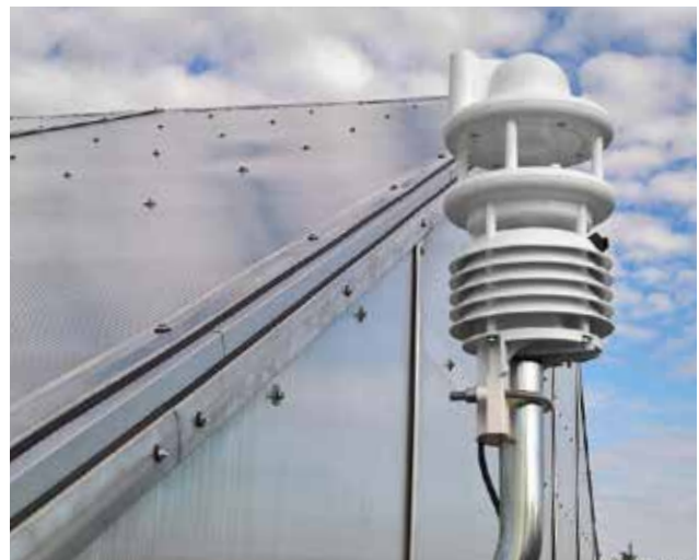
The weather station delivers measurements for an automatically regulated climate control system.