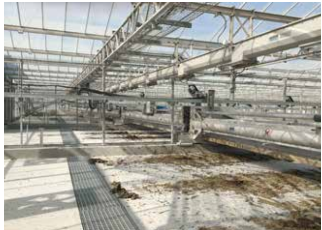
The screw conveyor installed in the floor collects the dry sludge.