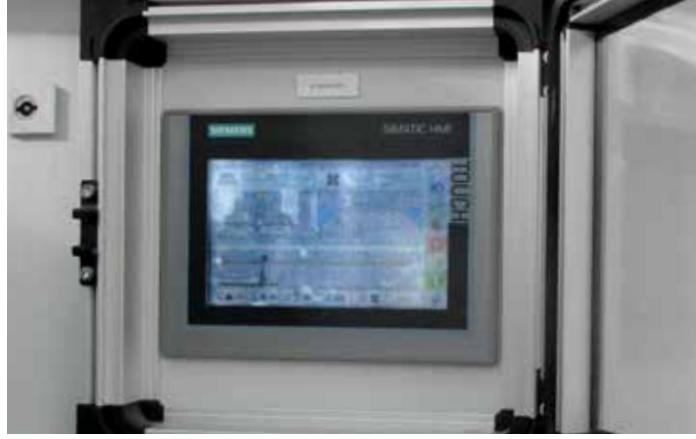
Touch panel for plant control.