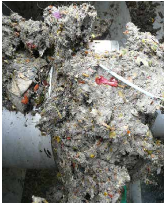
Discharge of the separated dewatered material.