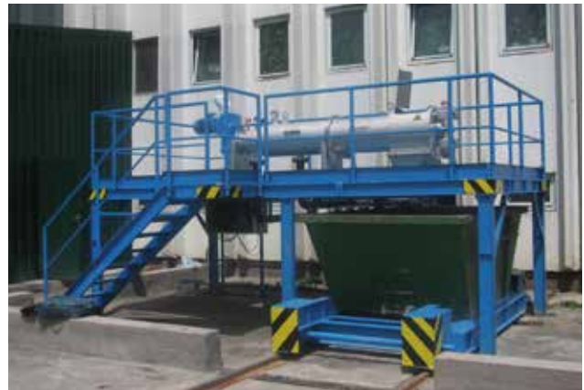
Outdoor installation of a HUBER Sludgecleaner STRAINPRESS® 290.