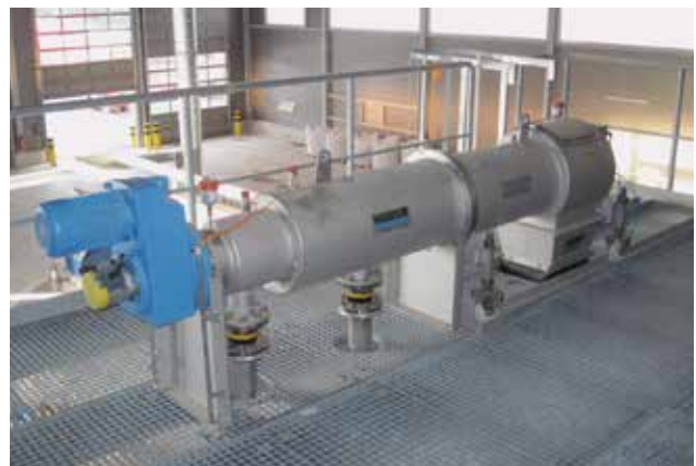
HUBER Sludgecleaner STRAINPRESS® applied for fermentation residue screening.