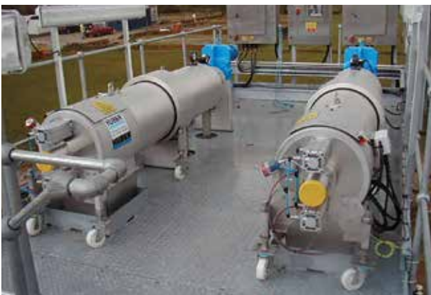
STRAINPRESS® with heatable casing pipe.