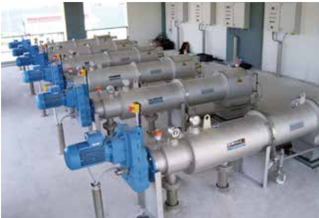
Sludge screening on a large sewage treatment plant.