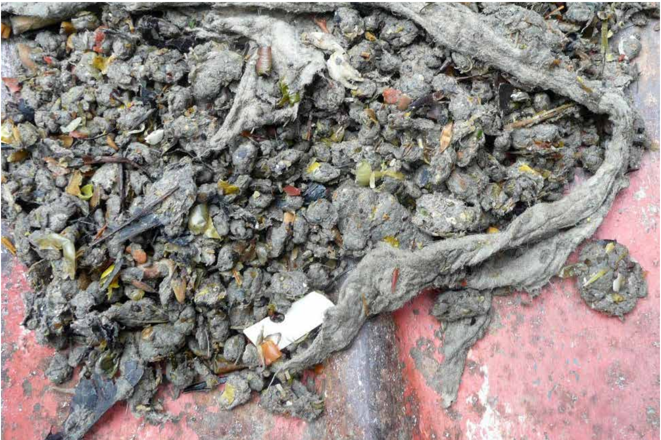
Separated material: wet wipes, leaves, plastics, foils, packaging residues, textiles, etc.