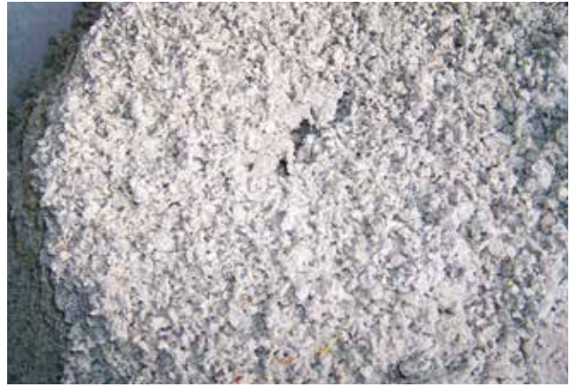
Particularly hair and fibres are separated by means of the two-dimensional square mesh design.

The solids retained on the screen basket surface lead to gradual blinding of the basket surface which has an