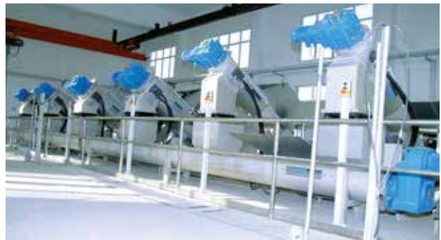
ROTAMAT® Membrane Screen RoMem units installed to protect a large downstream MBR plant .