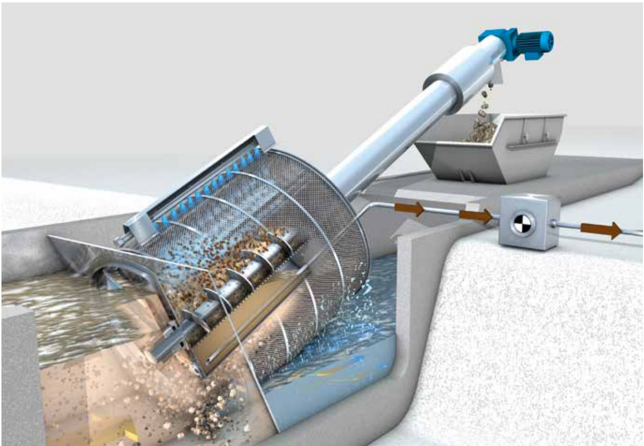
Schematic diagram of the ultra-fine ROTAMAT® Membrane Screen RoMem.

Mechanical preliminary wastewater screening at source is necessary to meet the requirements concerning waste-water discharge into sewer systems. Since wastewater fees depend on the freight discharged it is economically beneficial to minimise the freight by using a fine mesh screen. Especially attractive for customers are solutions which provide for the reuse of separated solids.