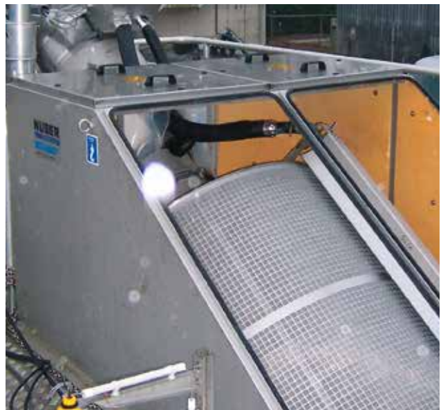
Outdoor installation with cover and insulated spray water line.