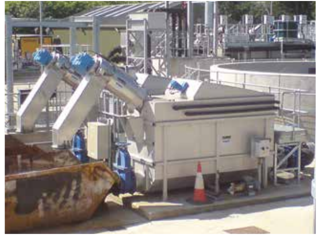
ROTAMAT® Membrane Screen RoMem units in tanks.