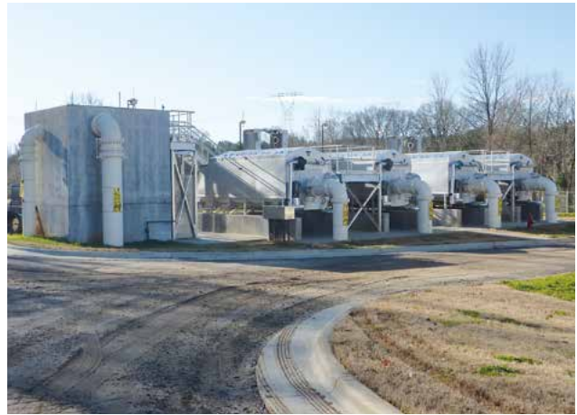
4 HUBER Disc Filter RoDisc® units with 18 discs installed in a concrete tank.