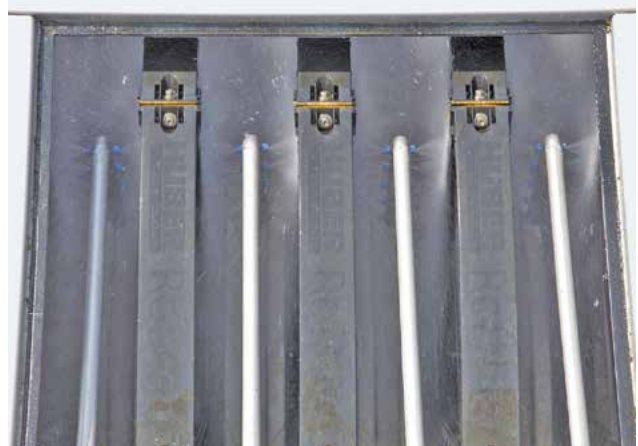
Backwashing of filter discs with filtrate – no external wash water required.