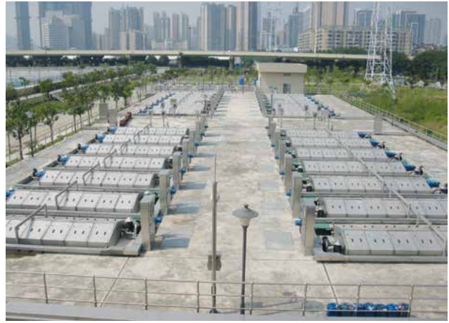
28 HUBER Disc Filter RoDisc® units with 24 discs each treating about 8.5 m 3 wastewater per second.