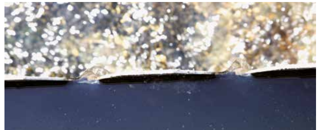
Activated sludge flocs sometimes are insufficiently retained by the secondary clarifier.